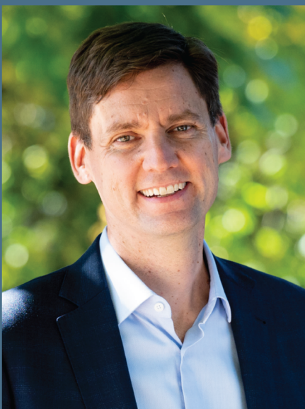
HON. DAVID EBY, KC PREMIER OF B.C.