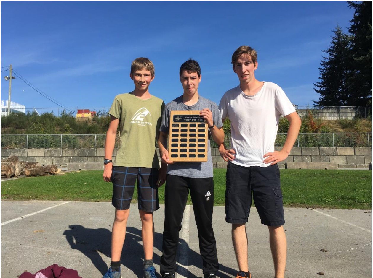
The Winners of the Terry Fox Run

Every year Terry Fox Runs are held in over 9000 communities across Canada with the goal of raising funds for cancer research. Mission Senior Secondary proudly participated in this event. Leadership started off the day with fun games outside. Students then ran or walked a 2 km route to show support for Terry Fox. After the run was a hotdog by donation. Leadership students barbecued 15 dozen hotdogs. Students and staff raised more than $600 for cancer research. Way to go MSS!