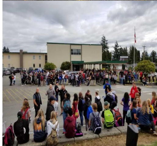
Leadership students and MSS students welcoming The Tour de Valley