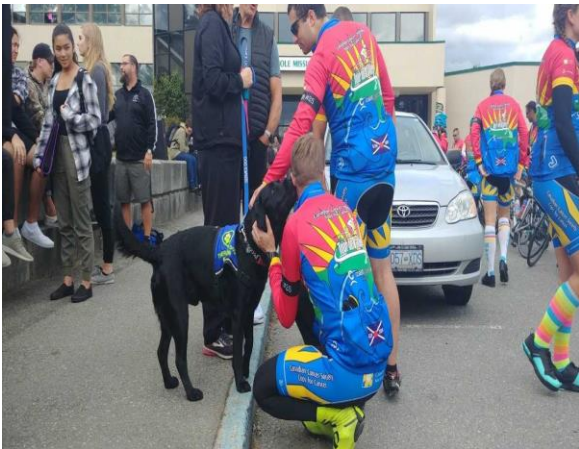
The Cops for Cancer team giving some love to our own support dog - Merlin.