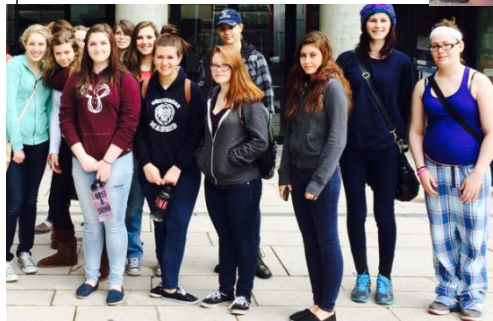
Photo 11/12 students were fortunate enough to visit Vancouver Art Gallery on April 7th and with the guidance of gallery docents visited the Edward Byrtynsky show. His work talks about the ravages of our environment around the globe and in a starkly reflective way brings us to think about the damage we are all complicit in through the conscious choices we make daily.